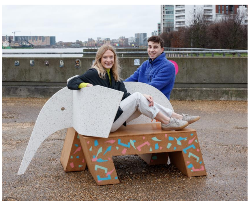
ELE-Bench by RAB Studio, 2020 competition winner Thames Barrier Park