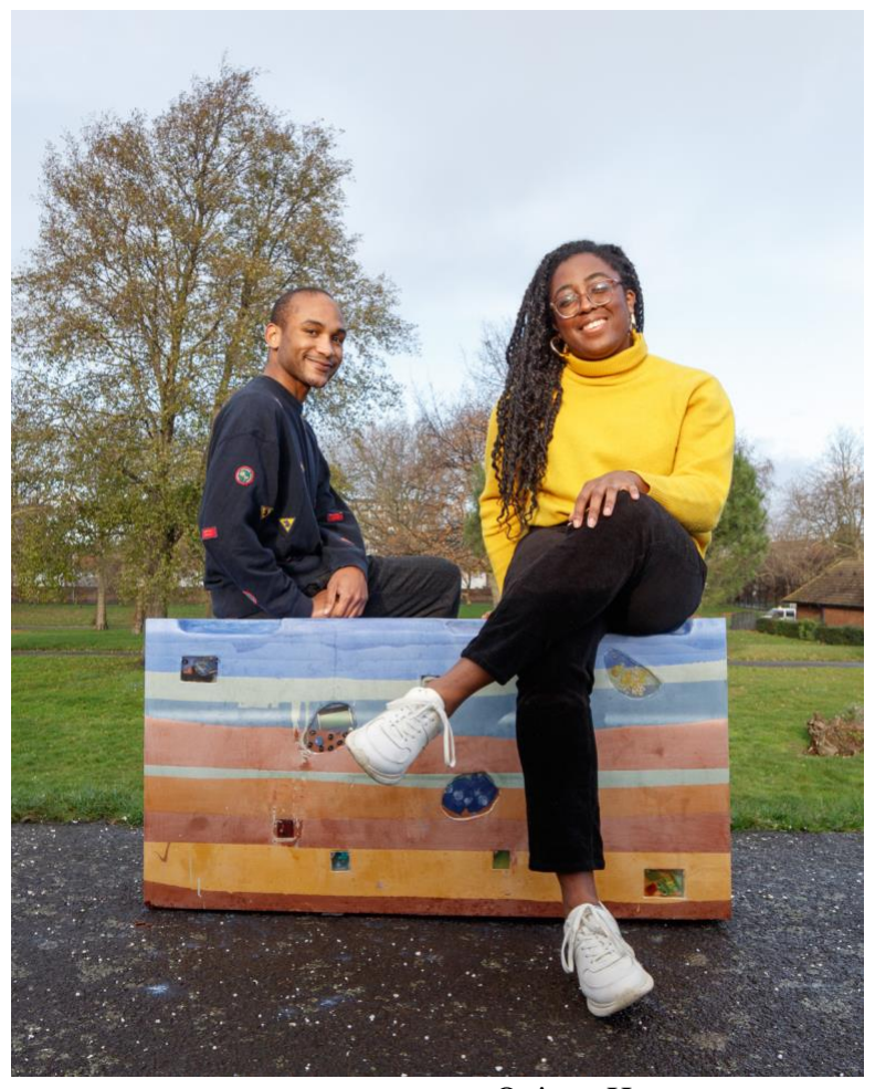
Water, Water Everywhere by Betty Owoo and Quincy\ Haynes , 2020 competition winner Royal Victoria Garden