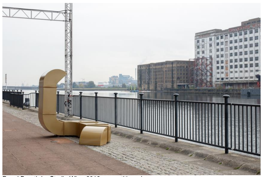
Royal Breath by Studio Who, 2019 competition winner Dock edge in front of ExCeL