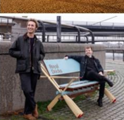
Winning benches from 2020