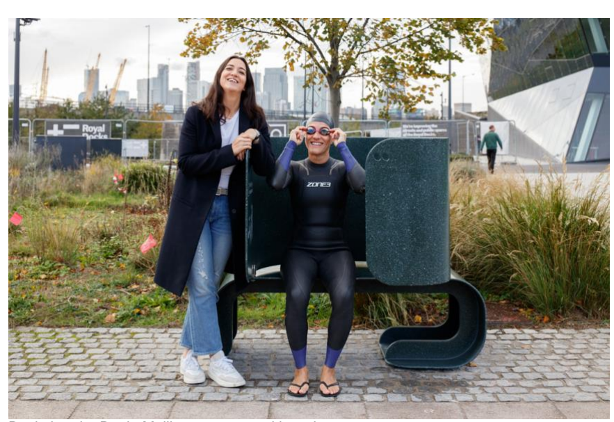
Peekaboo by Portia Malik, 2019 competition winner Dock edge in front of The Crystal