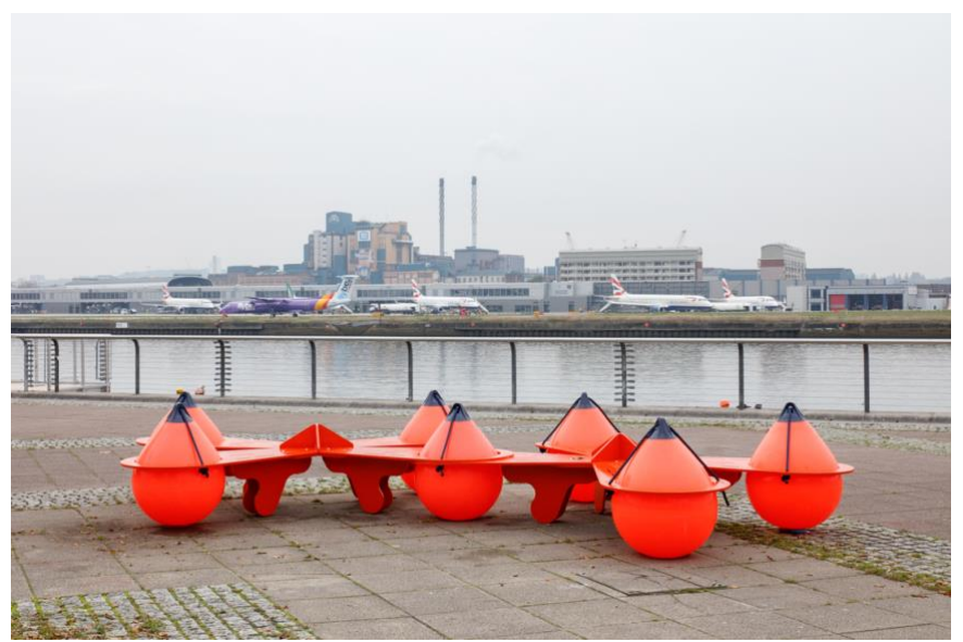
The Buoys are Back in Town by McCloy + Muchemwa, 2019 competition winner Dock edge near Building 1000 (this bench is not on display at the moment)