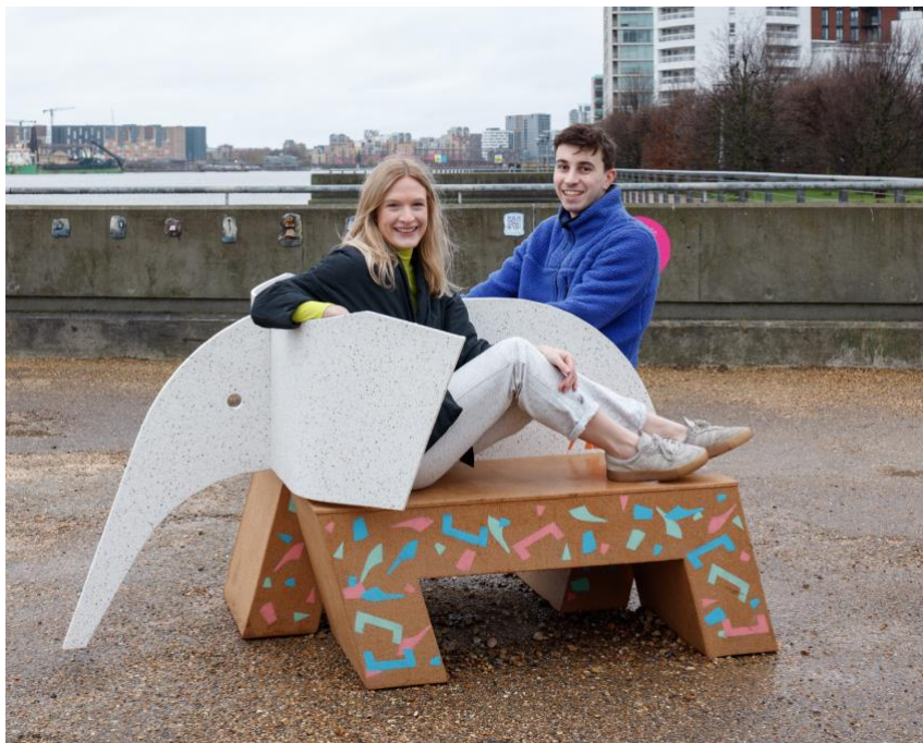
ELE-Bench by RAB Studio , 2020 competition winner Thames Barrier Park