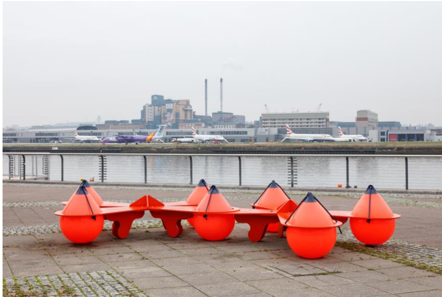
The Buoys are Back in Town by McCloy + Muchemwa, 2019 competition winner Dock edge near Building 1000 (this bench is not on display at the moment)