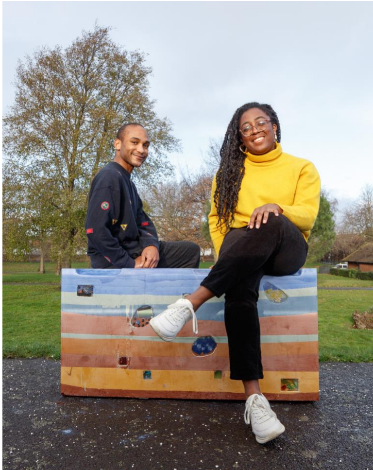
Water, Water Everywhere by Betty Owoo and Quincy Haynes , 2020 competition winner Royal Victoria Garden