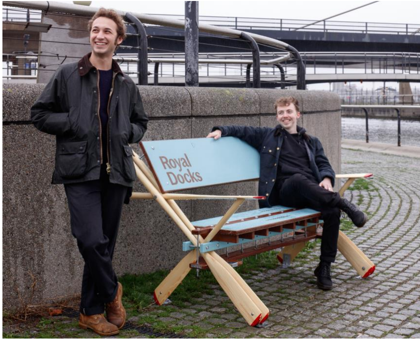
Afloat by Ben Child and Luca Luci , 2020 competition winner Connaught Crossing North