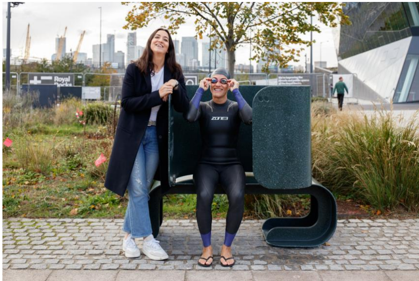
Peekaboo by Portia Malik, 2019 competition winner Dock edge in front of The Crystal