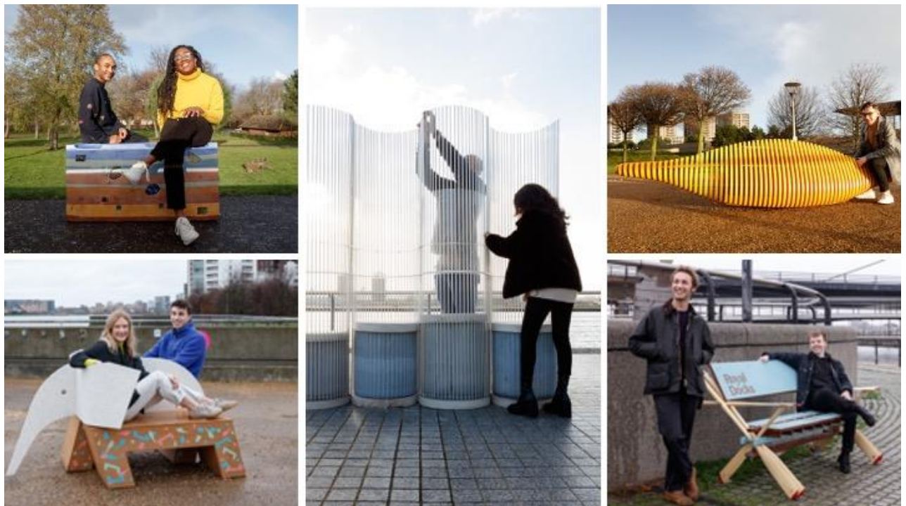
Winning benches from 2020