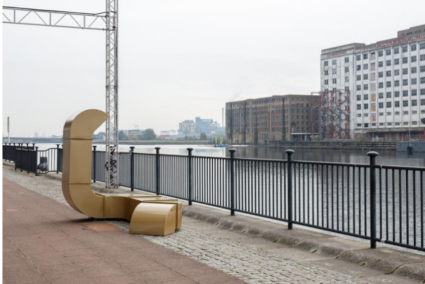
Royal Breath by Studio Who, 2019 competition winner Dock edge in front of ExCeL