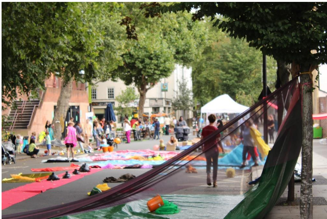
Previous road closure of Phoenix Road

Several Council led projects are underway in Somers Town and set to improve the area. Some of these are the GLA funded Future Neighbourhoods projects , the greening of estates, Central Somers Town, and Greening Phoenix Road . Consideration to these projects should be given when developing the proposals.