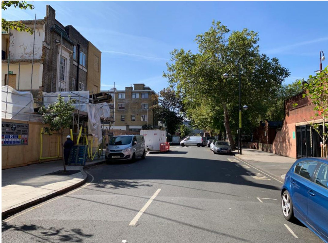
View of Phoenix Road