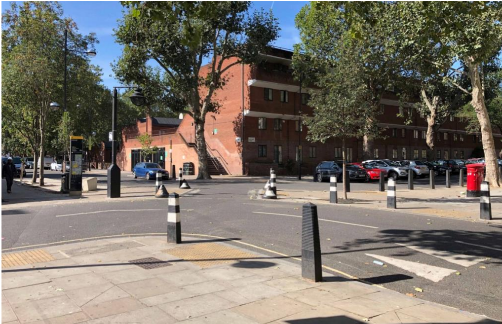
View of Phoenix Road and Chalton Road