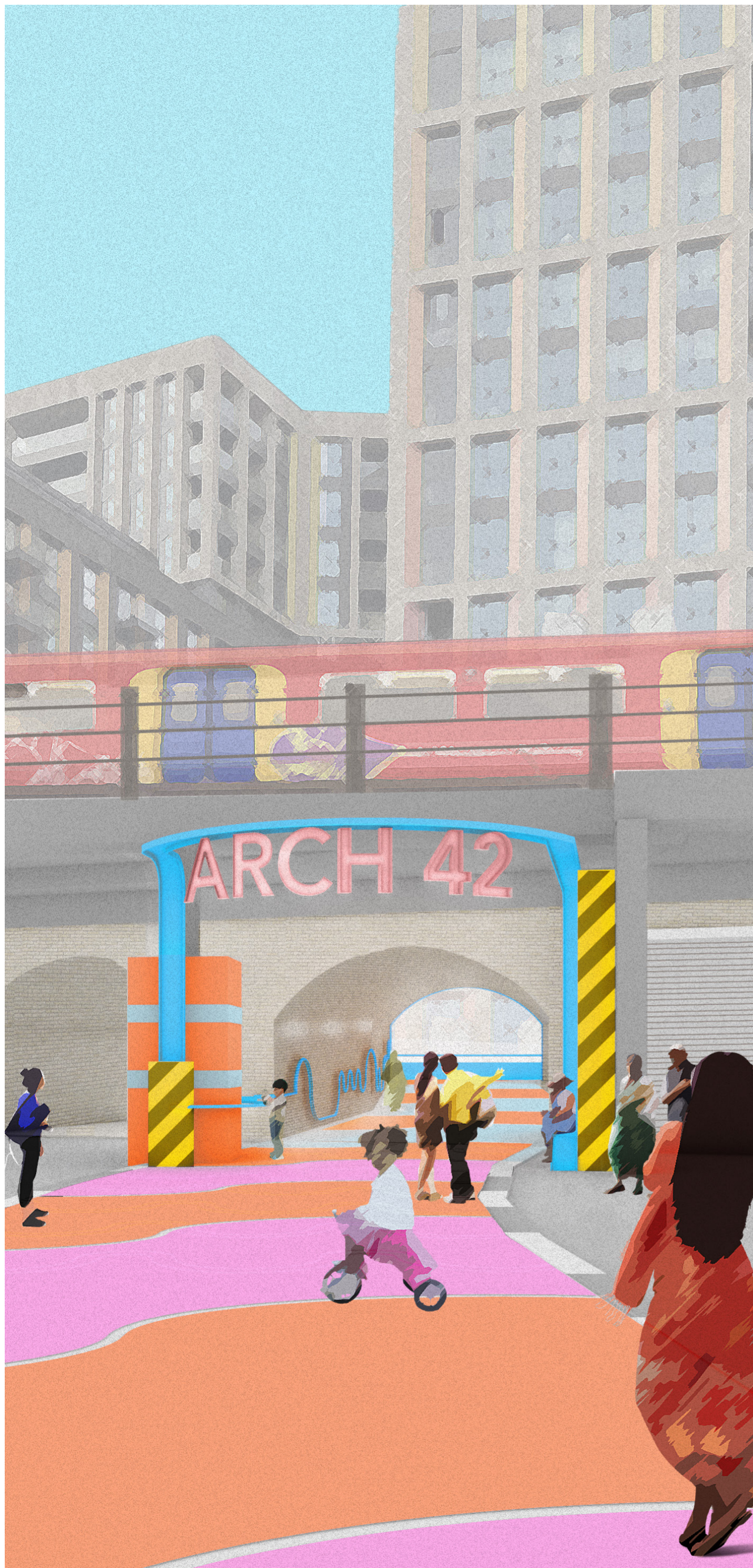
ARCH 42 - SOUTH SIDE