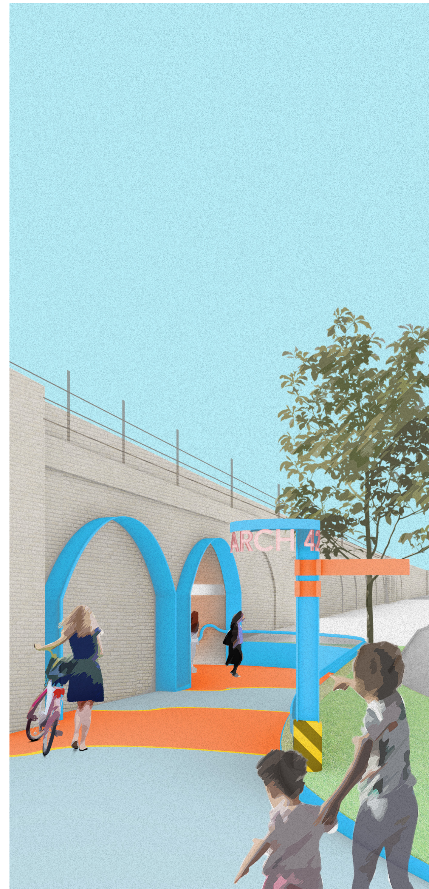
ARCH 42 - NORTH SIDE

In an uncertain time where the opportunity to visit traditional spaces of art and culture is scarce or restricted, we think that moments of transition in the city—be it a bus stop, a bridge, or in this case an arch—can be a real moment of joy and delight that can position itself as a point of rich cultural engagement in equal measure.