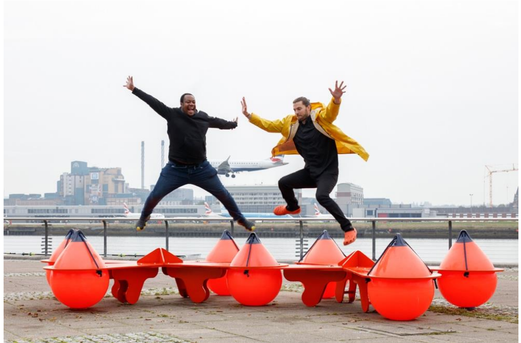
Buoys Are Back In Town by McCloy + Muchemwa, 2019.