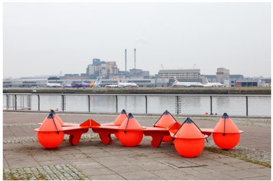
The Buoys are Back in Town by McCloy + Muchemwa, 2019 competition winner Dock edge near Building 1000 (this bench is not on display at the moment)