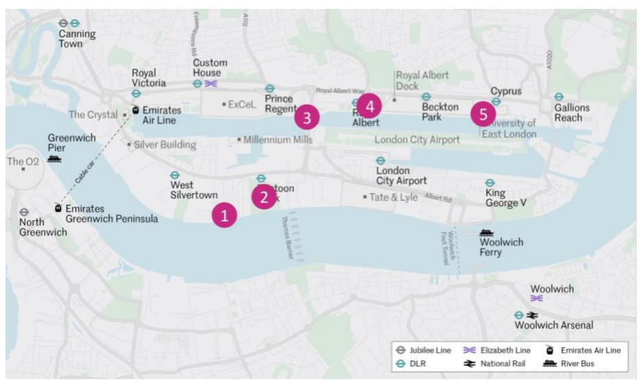
Map of the wider area