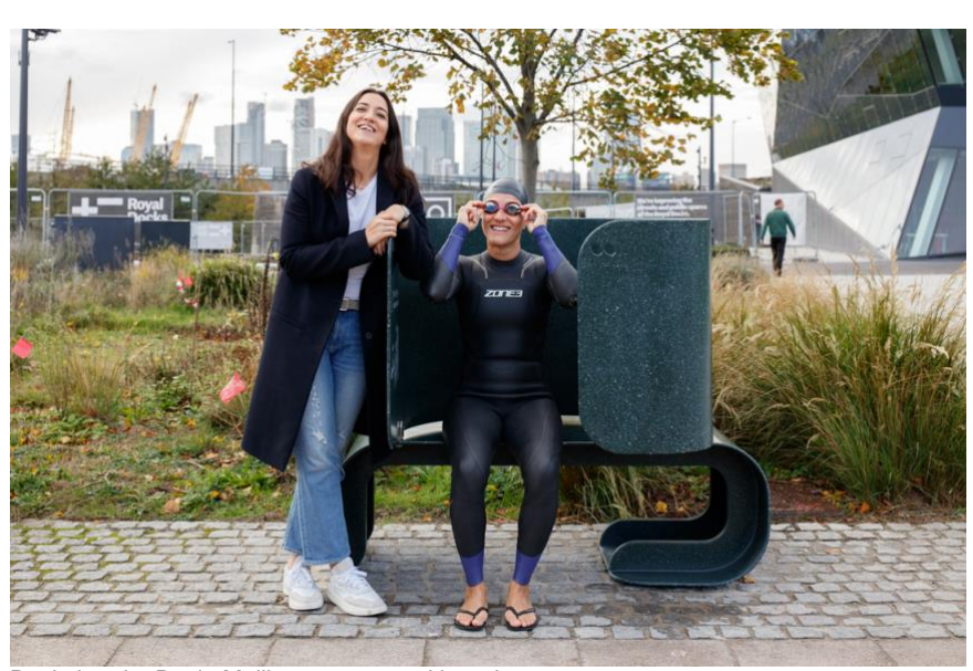
Peekaboo by Portia Malik, 2019 competition winner Dock edge in front of The Crystal