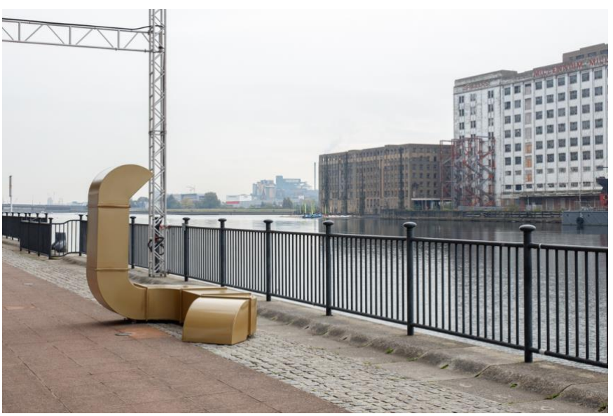
Royal Breath by Studio Who, 2019 competition winner Dock edge in front of ExCeL